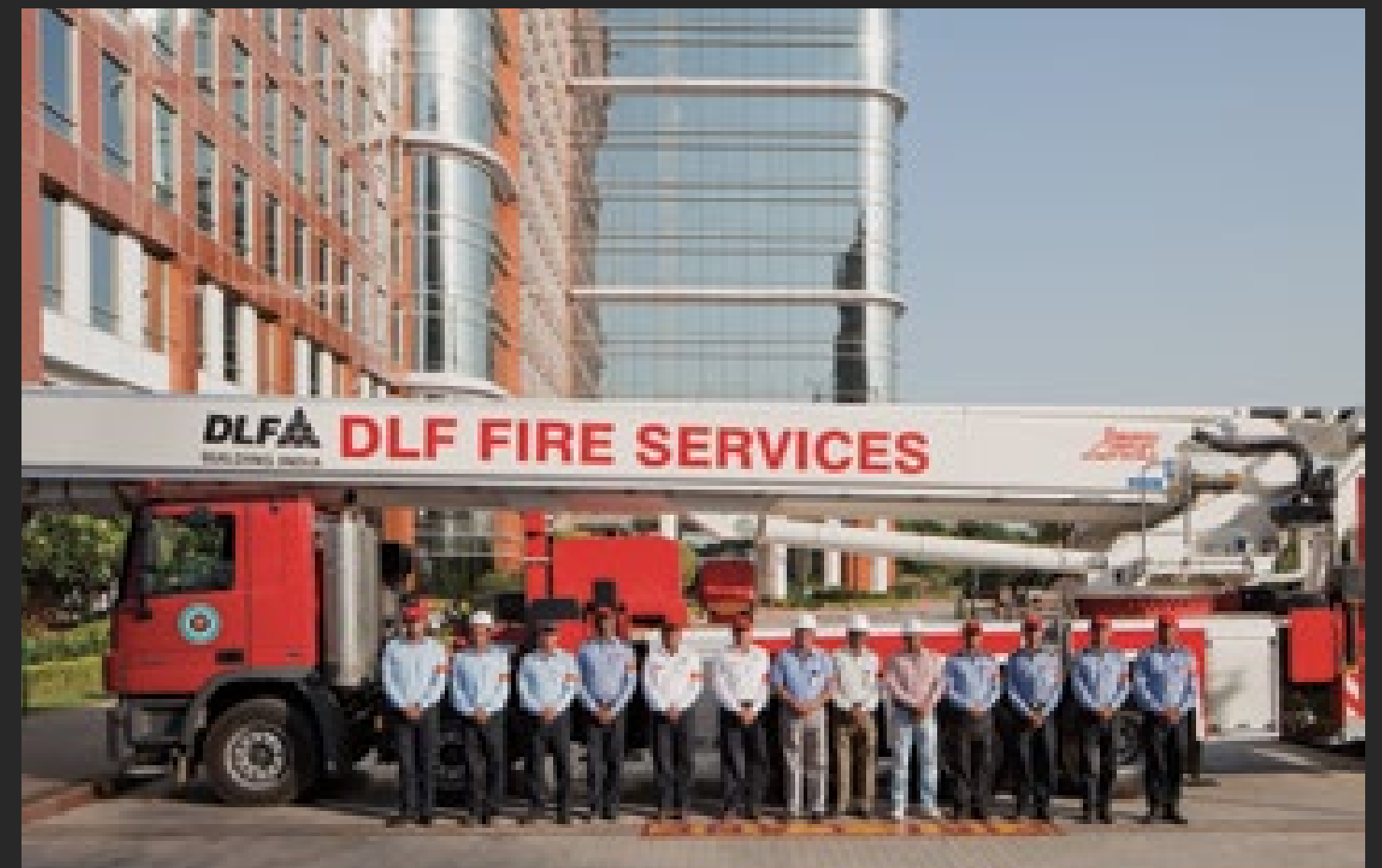
DLF Fire Services