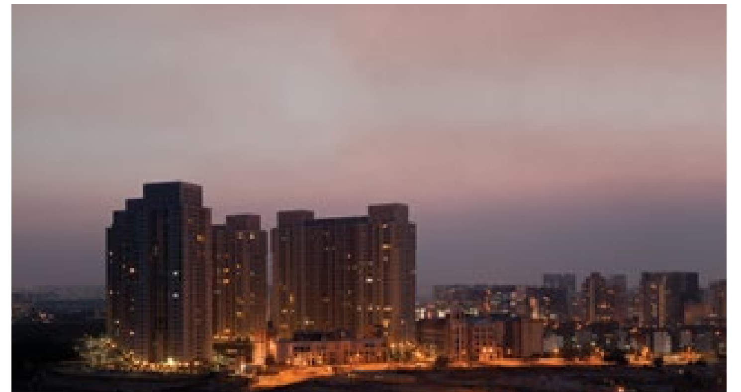
Actual views from The Crest site.