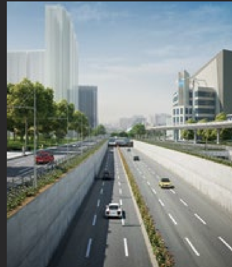
Artistic rendition of Ch. Raghendra Singh Marg