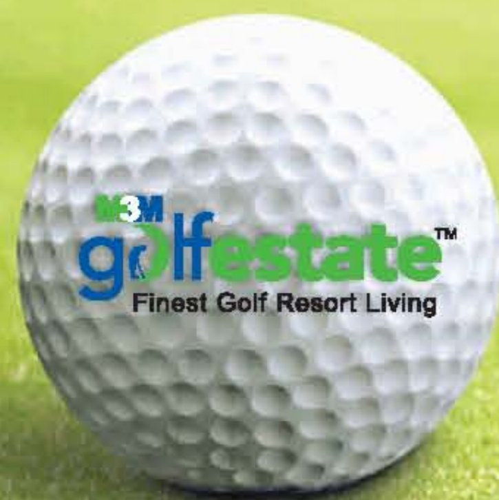
CLASSIC GOLF COURSE