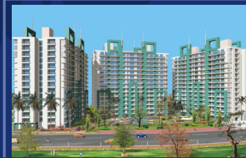
KRISHNA APRA SAPPHIRE Indirapuram, Ghaziabad