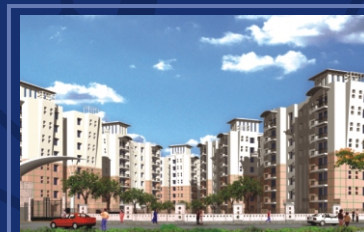
KRISHNA APRA RESIDENCY Noida