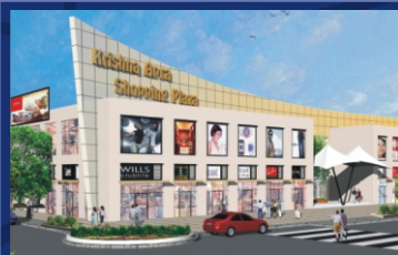
KRISHNA APRA SHOPPING PLAZA Indirapuram, Ghaziabad