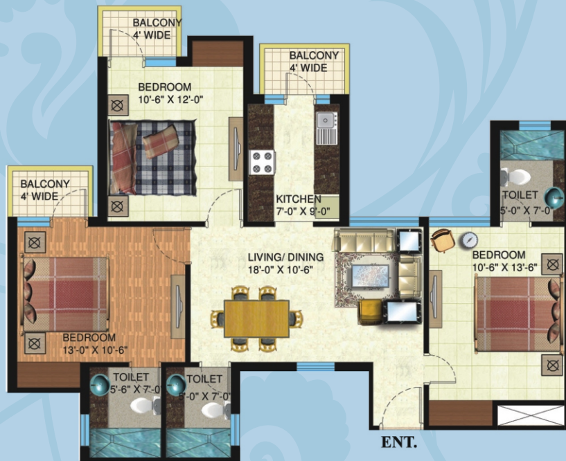
3 Bedroom Unit Plan Super Area - 1340 sq.ft.