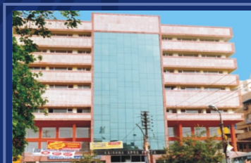
KRISHNA APRA PLAZA Noida