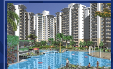
KRISHNA APRA GARDENS Indirapuram, Ghaziabad