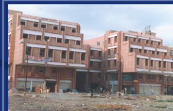
APRA PLAZA Road No. 44, Pitam Pura, New Delhi