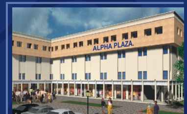
KRISHNA APRA ALPHA PLAZA Greater Noida