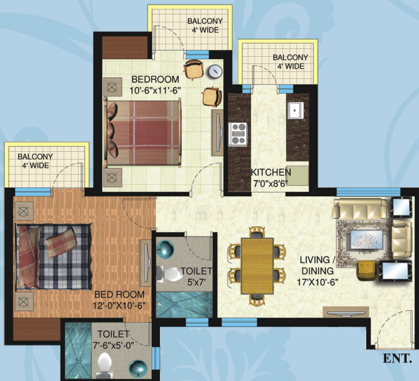
2 Bedroom Unit Plan Super Area - 1050 sq.ft.