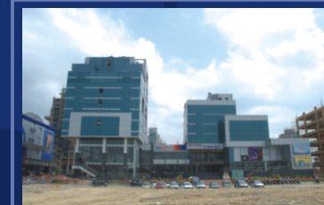
KRISHNA APRA BUSINESS SQUARE Pitam Pura, New Delhi