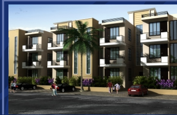
MAPSKO CITY HOMES Sector-27, Sonapat