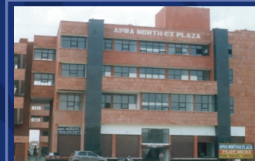
APRA NORTH-EX PLAZA Pitam Pura, New Delhi