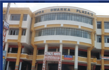
APRA DWARKA PLAZA-I Dwarka, Delhi