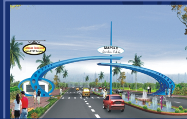
MAPSKO GARDEN ESTATE 150 Acres township Sector-26, 26-A, 27, Sonapat