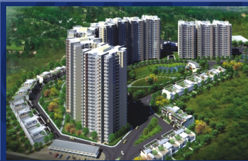
MAPSKO CASABELLA Sector-82, NH-8, Gurgaon