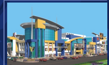
KRISHNA APRA DMALL Indirapuram, Ghaziabad