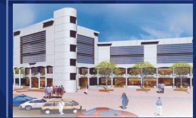
KRISHNA APRA PARK PLAZA Greater Noida