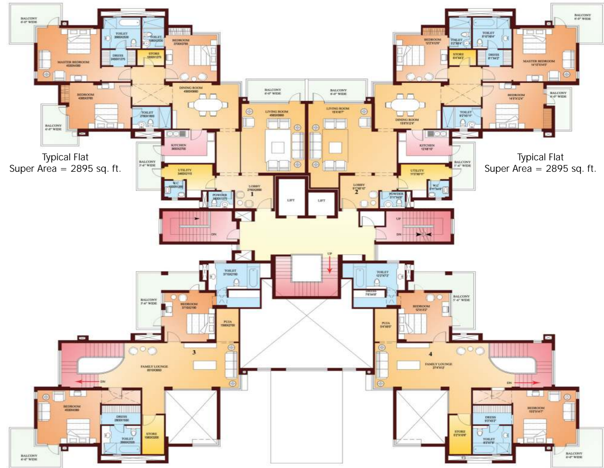
Typical Flat Super Area = 2895 sq. ft.