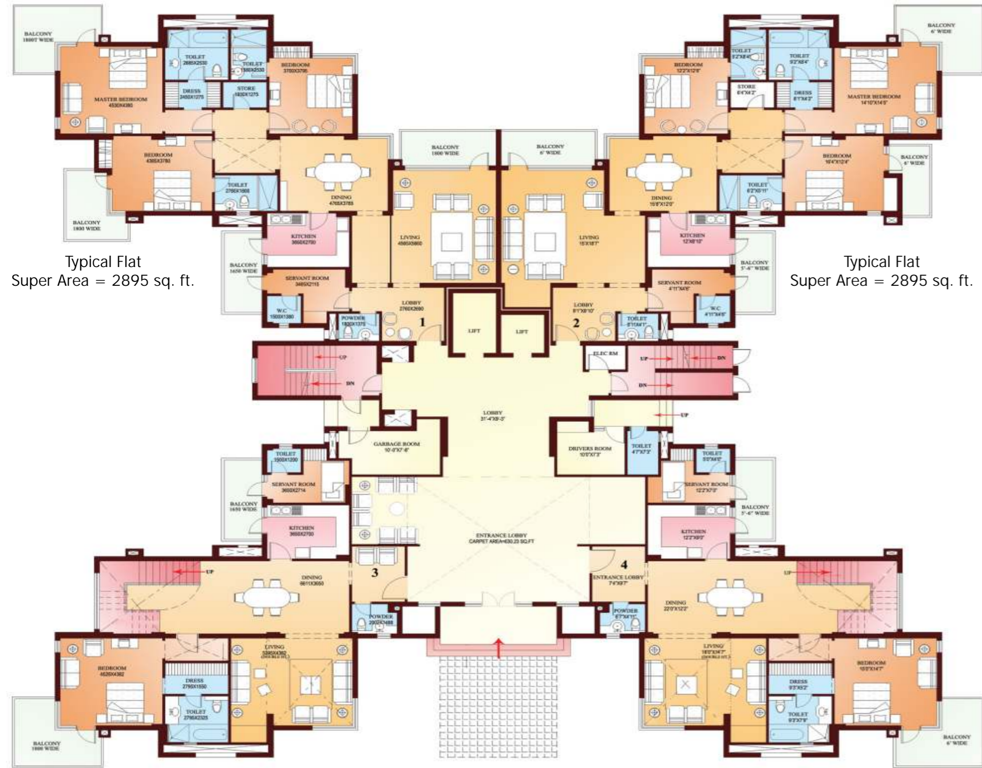
Typical Flat Super Area = 2895 sq. ft.