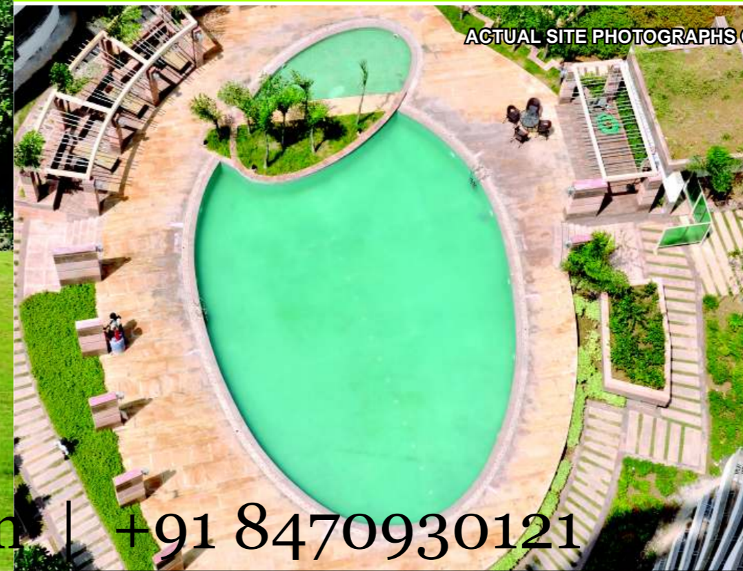
ACTUAL SITE PHOTOGRAPHS OF POSSESSION OFFER TOWERS