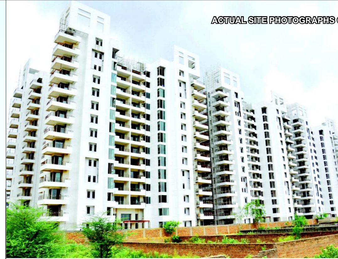
ACTUAL SITE PHOTOGRAPHS OF POSSESSION OFFER TOWERS