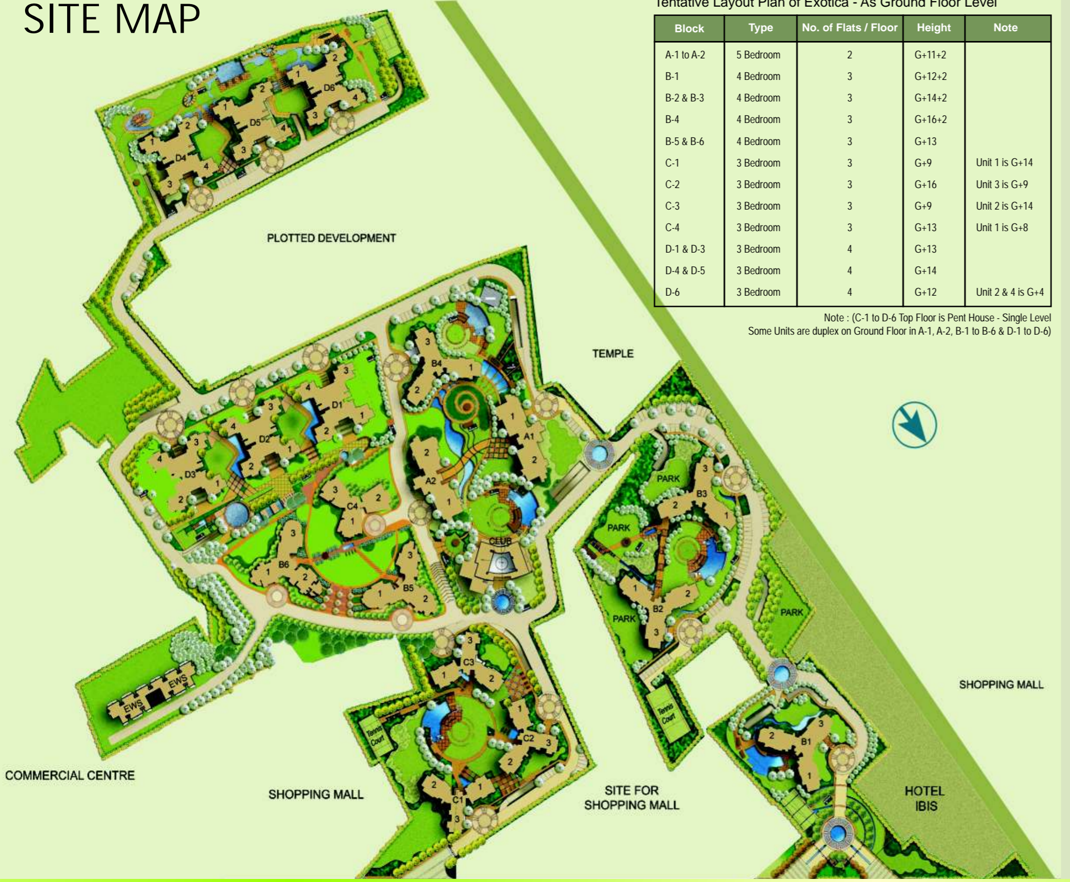
Tentative Layout Plan of Exotica - As Ground Floor Level