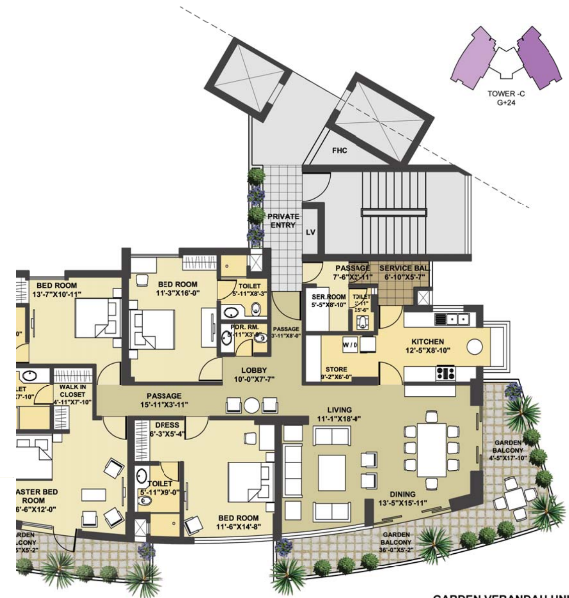
GARDEN VERANDAH UNIT 4BR + SQ. 3104 Sq.Ft.