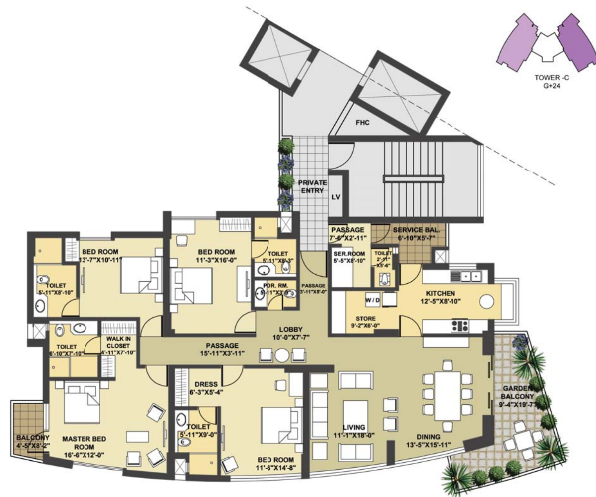
VERANDAH UNIT 4BR + SQ. 2821 Sq.Ft.