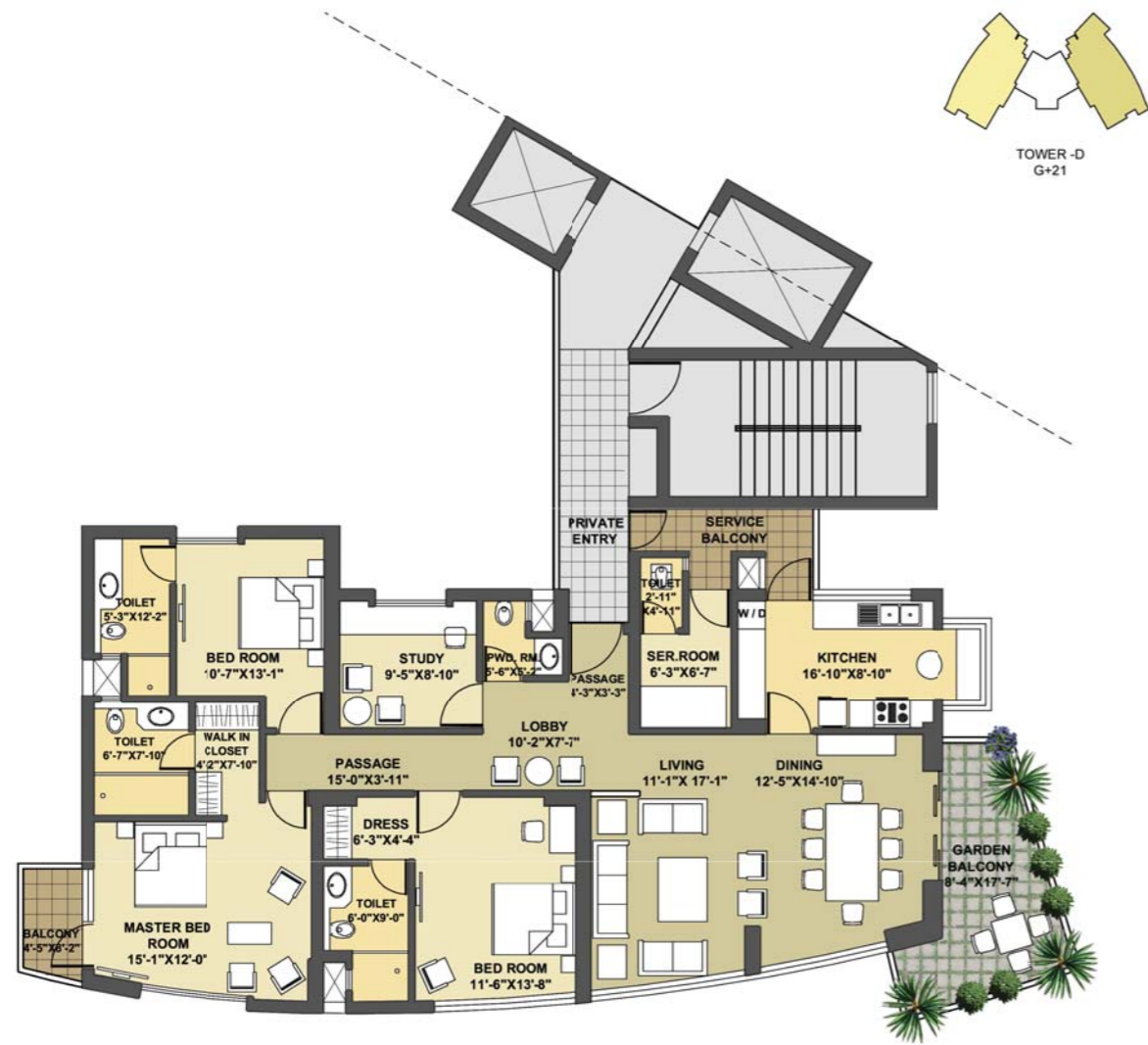
VERANDAH UNIT 3BR + SQ. 2420 Sq.Ft.