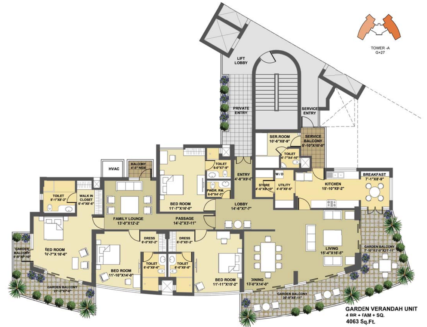
Tower A - 4 BHK