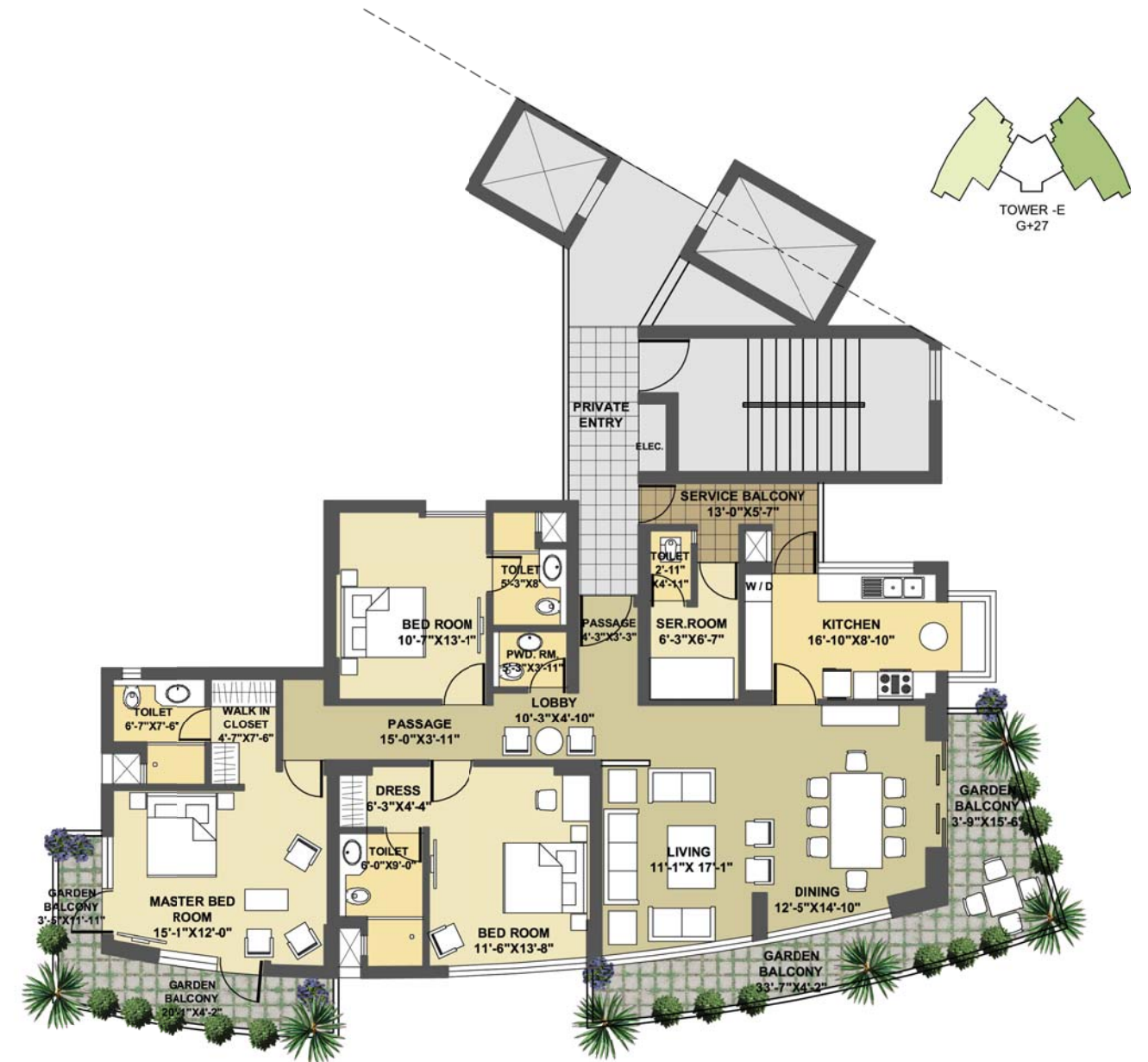
GARDEN VERANDAH UNIT 3BR + SQ. 2455 Sq.Ft.