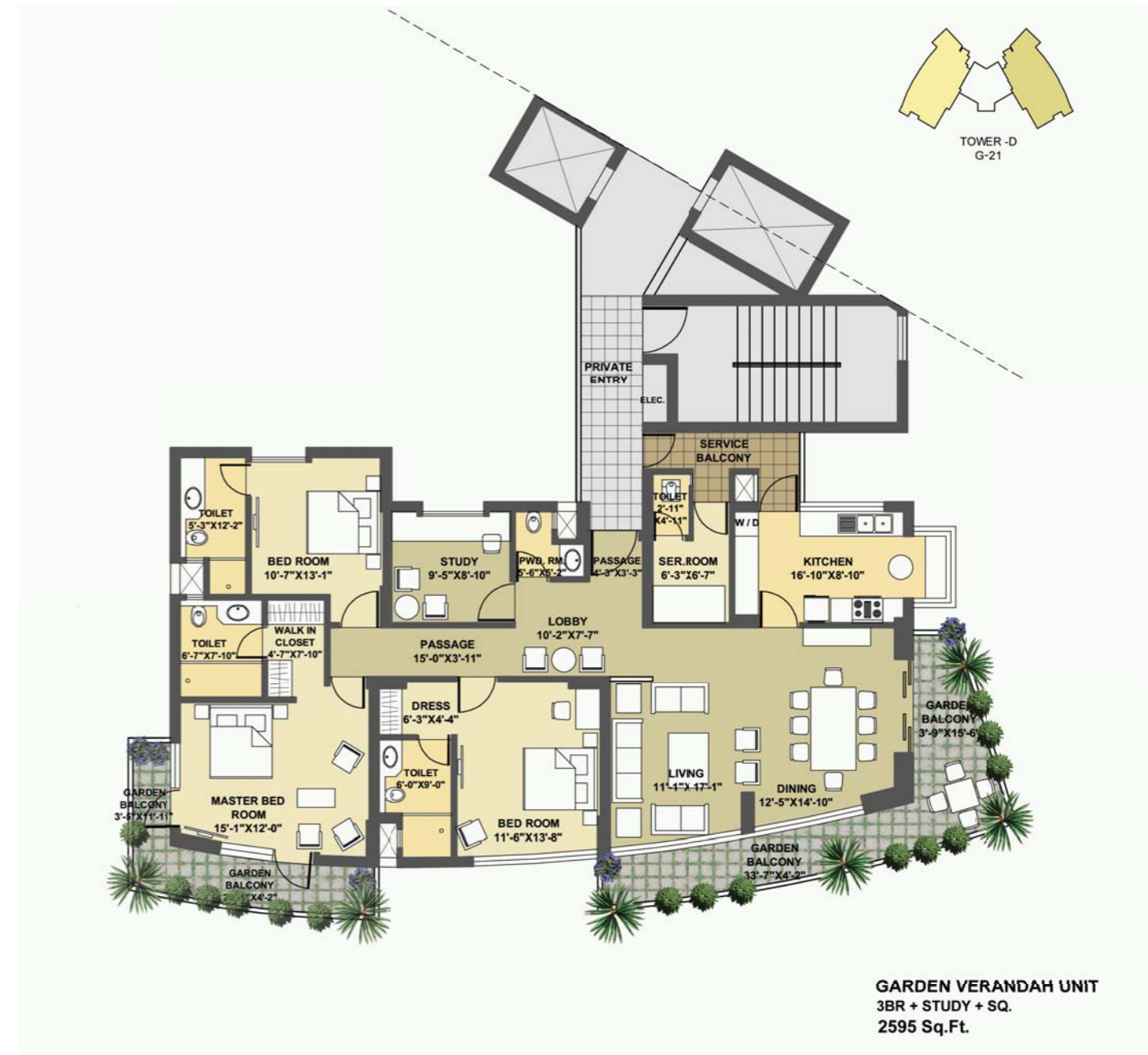
GARDEN VERANDAH UNIT 3BR + STUDY + SQ. 2595 Sq.Ft.