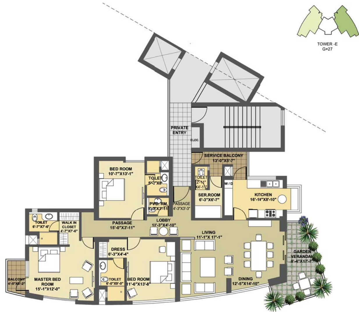
VERANDAH UNIT 3BR + SQ. 2279 Sq.Ft.