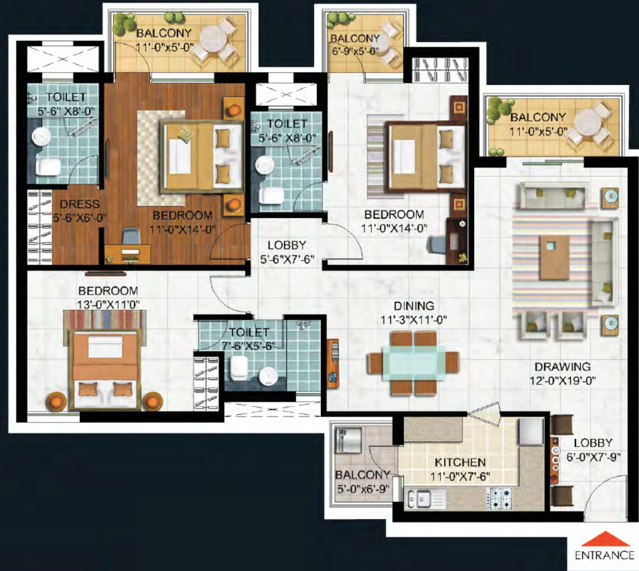
3 Bedroom 1725 sq. ft.