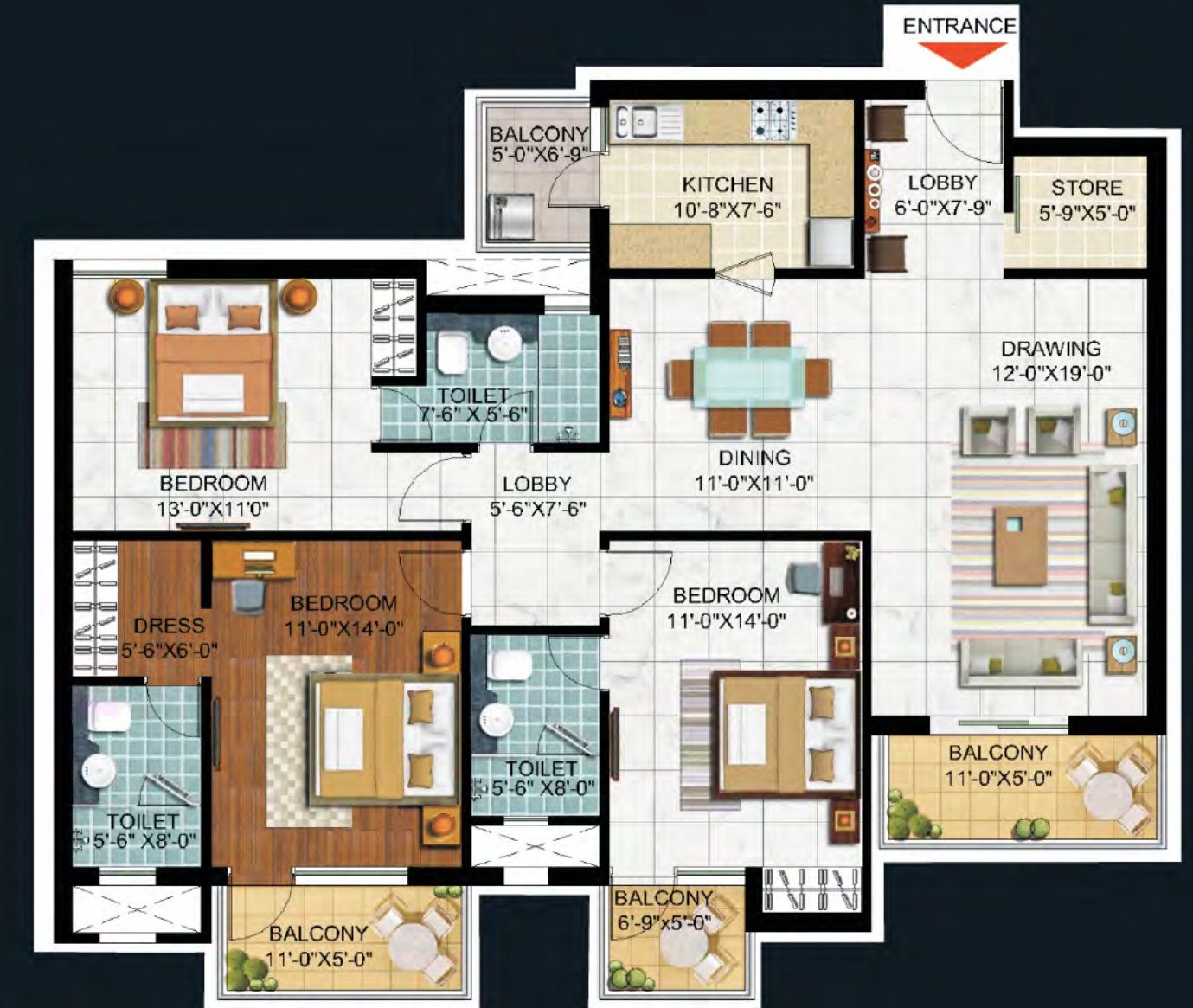
3 Bedroom 1750 sq. ft.