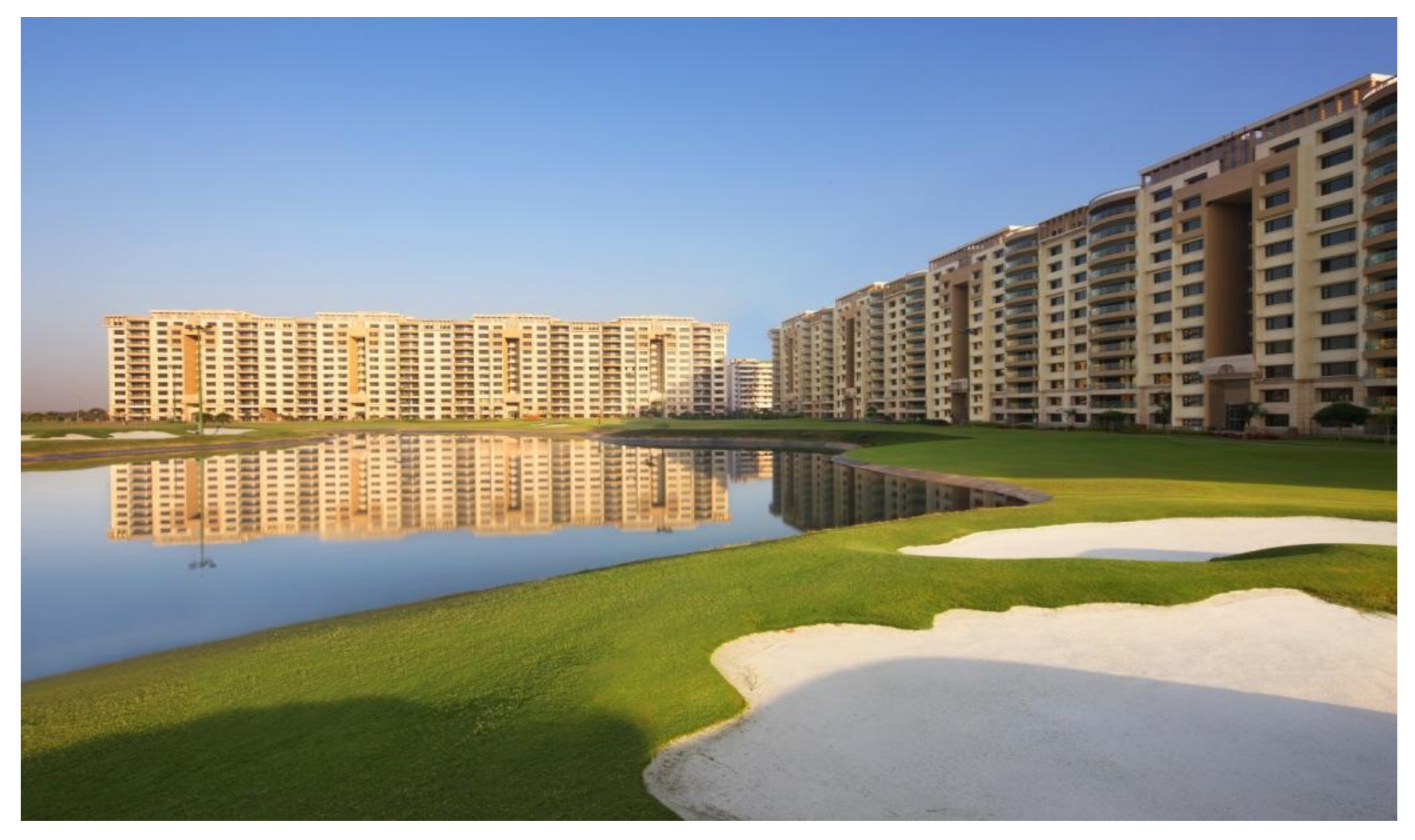
Leela Ambience – 5 Star Luxury Hotel and Serviced Apartments

1.8 million sq ft Shopping at Ambience Mall