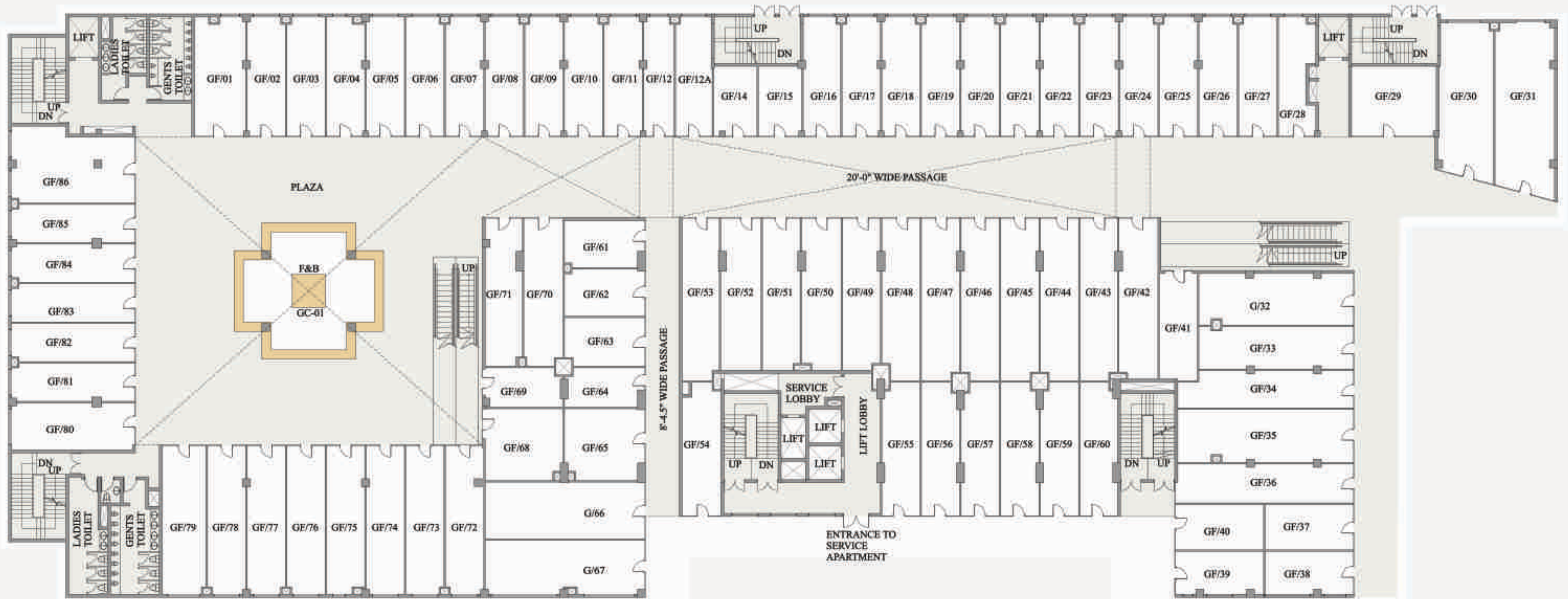
GROUND FLOOR LAYOUT PLAN