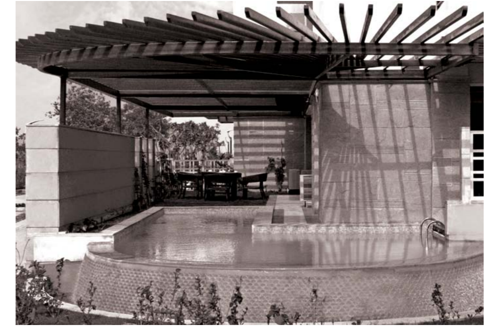
THE PRANAYAM, FARIDABAD