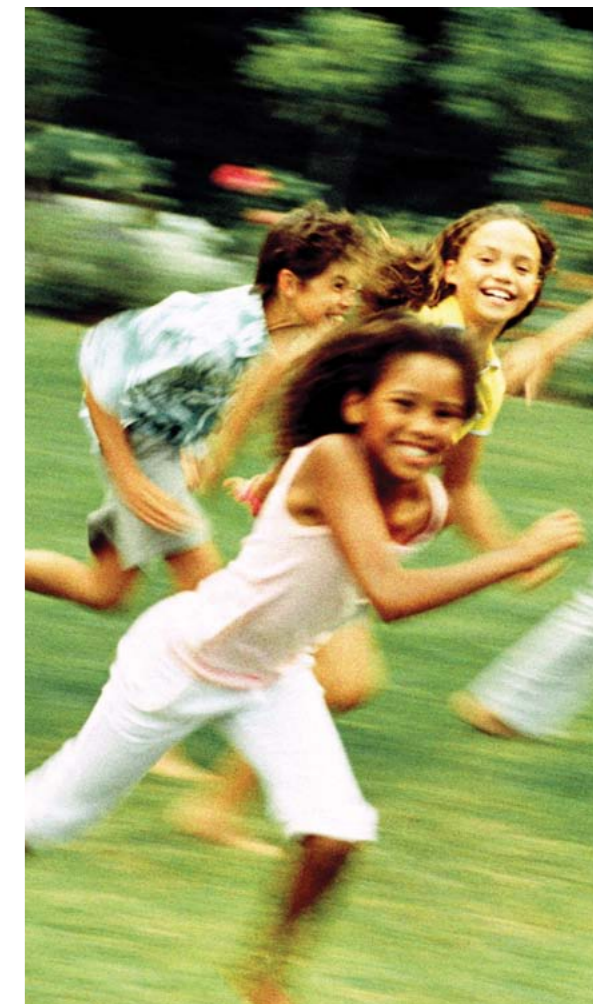
Children's play area