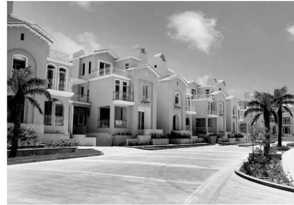
THE PALM SPRINGS, GURGAON

With a dedicated and efficient team, we create spaces which offer the best of features within record time. This has made us one of the fastest growing and the most respected real estate companies. The Palm Springs, Palm Springs Plaza, Pranayam, Pratham, VIP Floors and 81 High Street are projects that have set new benchmarks in both design and execution.