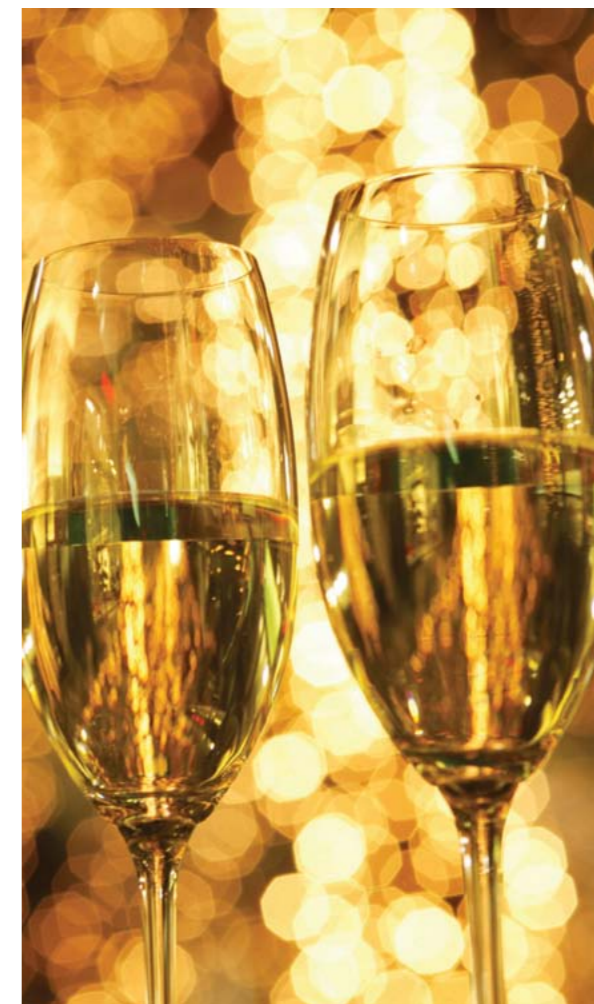
Club with lounge, Recreation room, Multi Community hall / function lounge