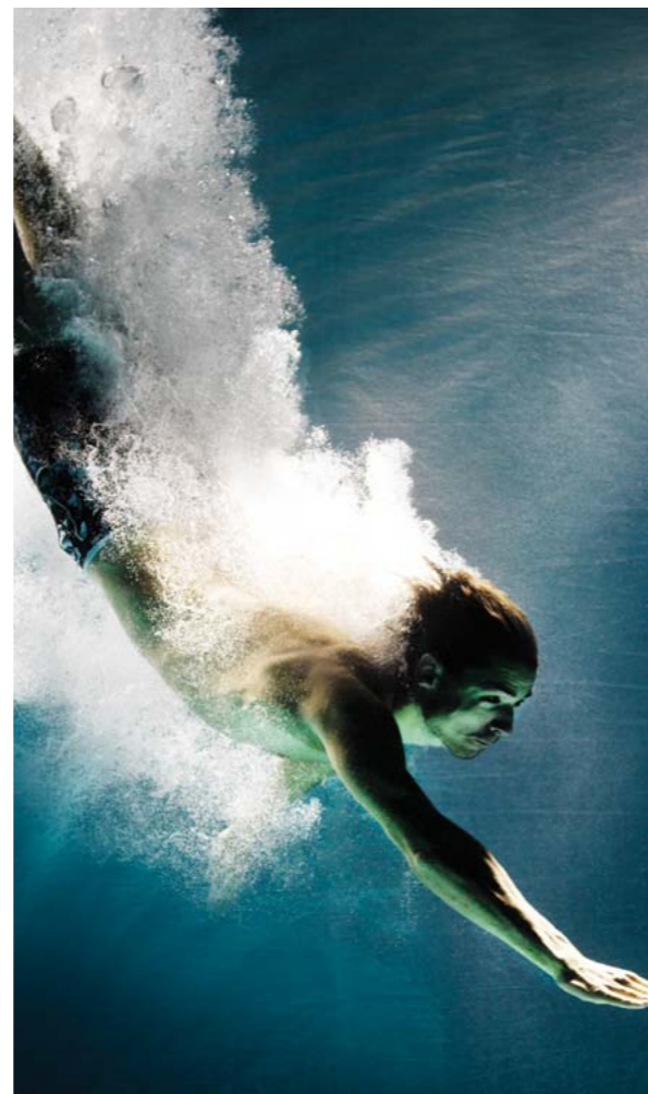
Expansive. L - shaped pool & kids' pool.