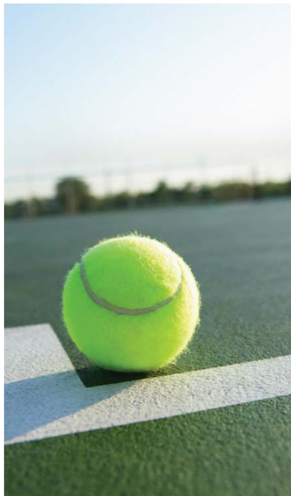
Sports facilities with Tennis Courts, Half court basketball, Table tennis & Badminton courts