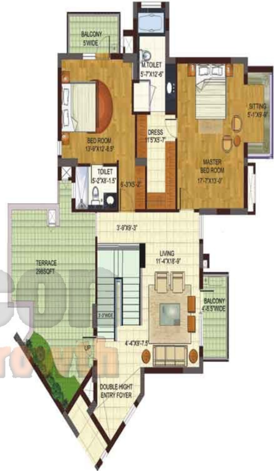
SLANT UNIT UPPER PENT HOUSE FLOOR

Saleable Area : 4632 sq. ft. Accommodation: