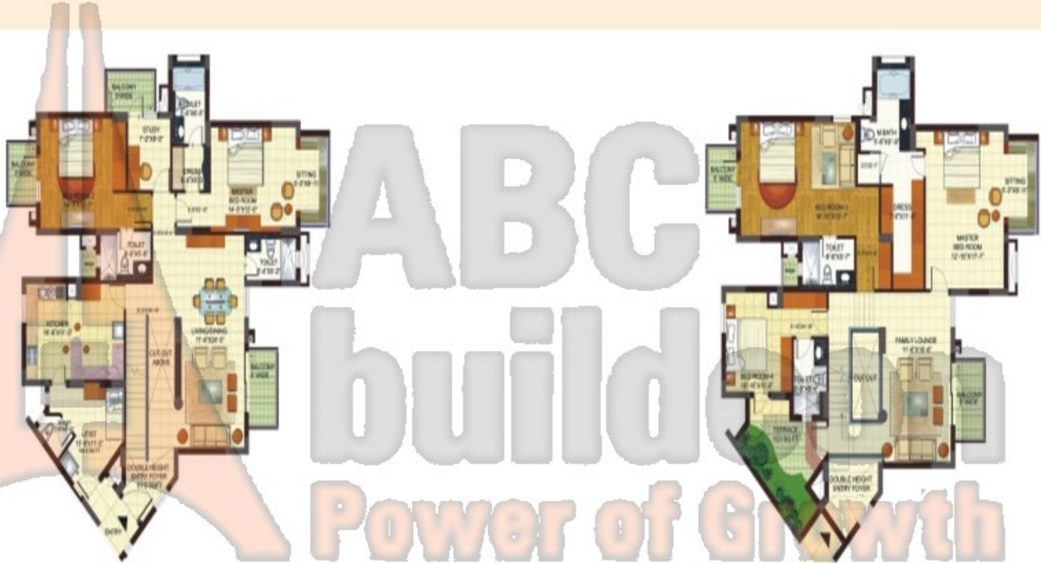
LOWER PENTHOUSE PLAN (P3)

Saleable Area : 5361 sq. ft. Accommodation: Five Bedrooms