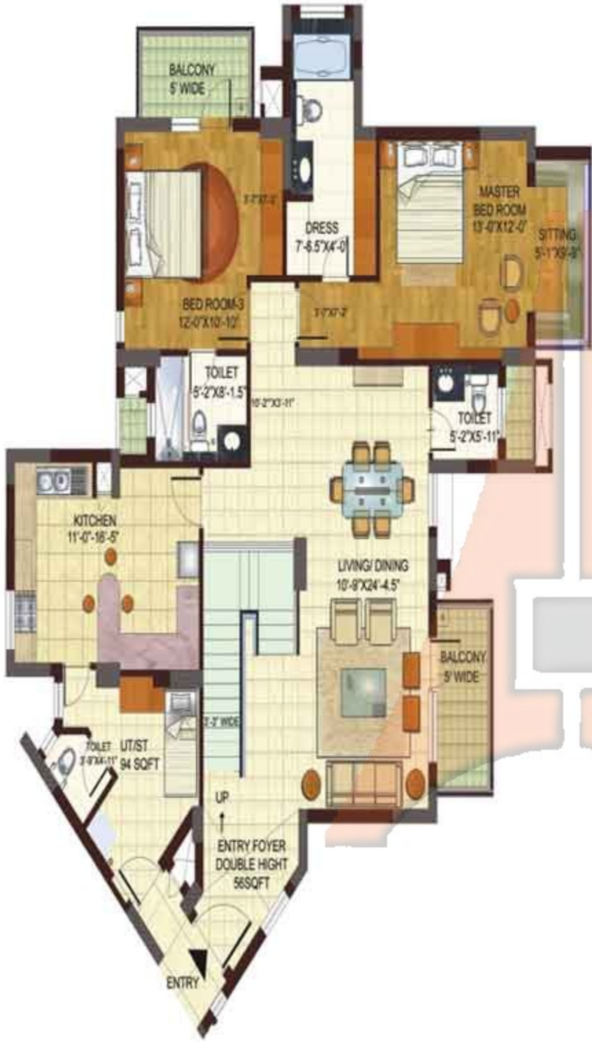
SLANT UNIT LOWER PENT HOUSE FLOOR

Saleable Area : 4362 sq. ft. Accommodation: