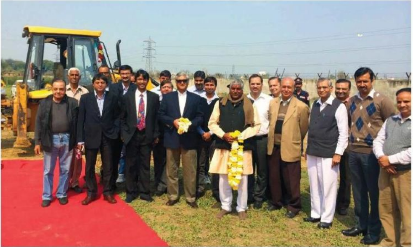
Team Silverglades at the Bhumi Pujan on the Merchant Plaza site