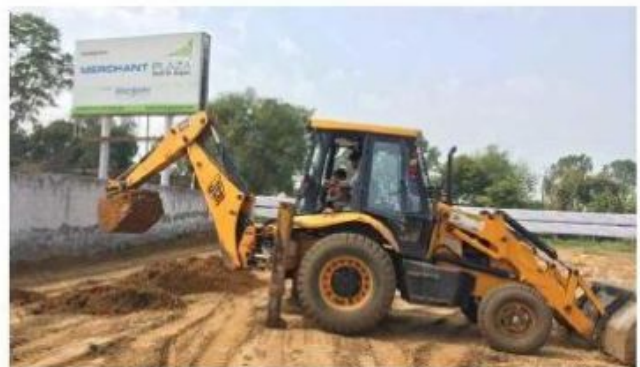
Excavation commenced at site (actual image)

Merchant Plaza is designed as a contemporary neighbourhood shopping and commercial hub spread across 2.75 acres in Gurgaon's upcoming Sector 88, adjoining the Dwarka Expressway. Merchant Plaza has been conceptualized to address three distinct end-uses: Retail, Commercial and Hospitality (service apartments).