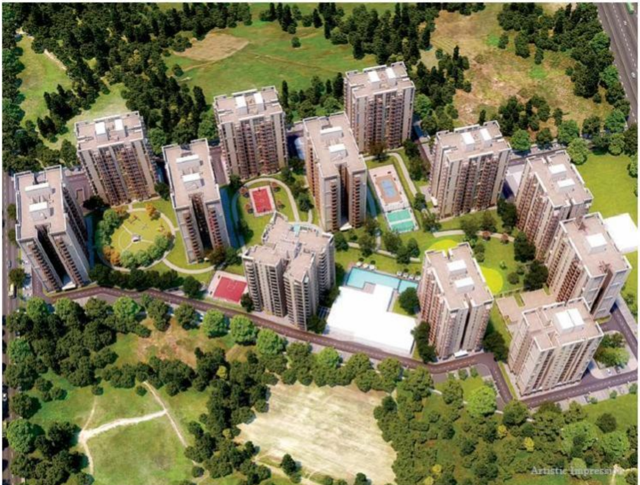
Aerial view of The Melia