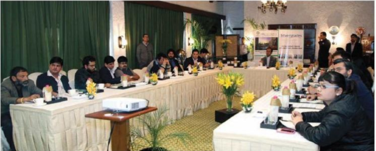
The Melia First Citizen – Media Briefing