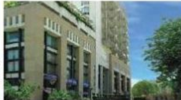
The Peach Tree*