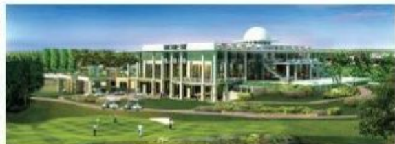
The Imperial Golf Estate*

For further information, Call: 9811654709