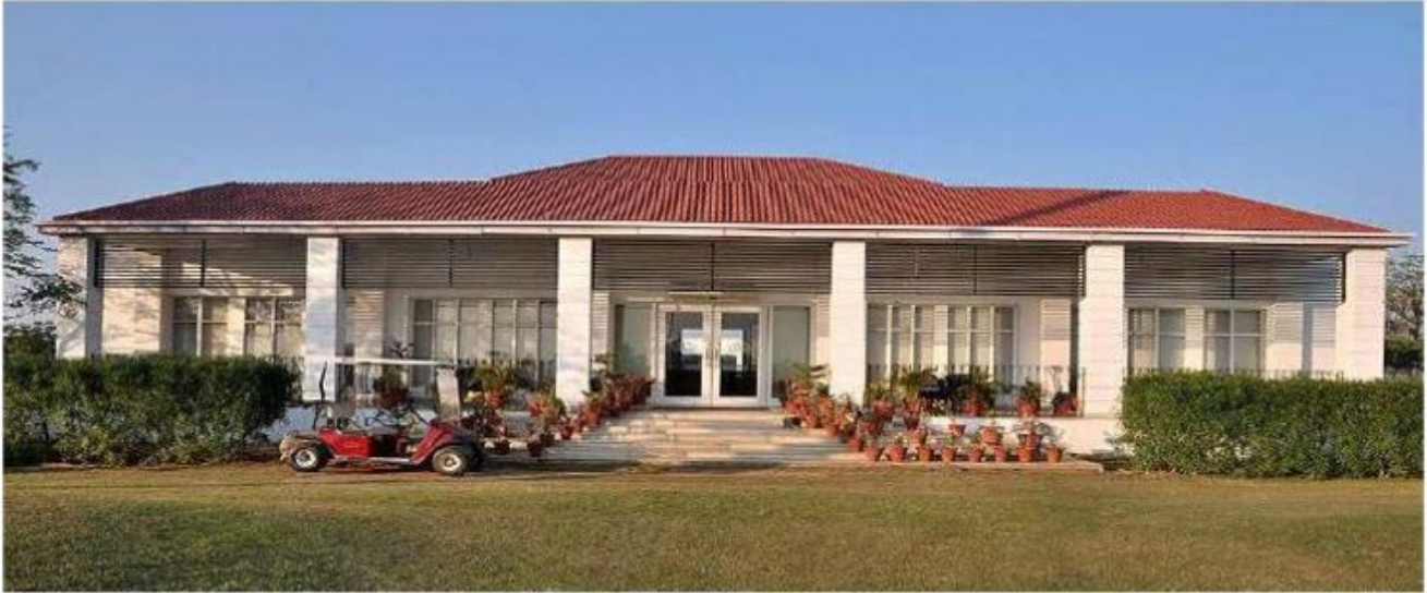
The Imperial Golf Academy-fully operational