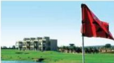
Tarudhan Valley Golf Resort