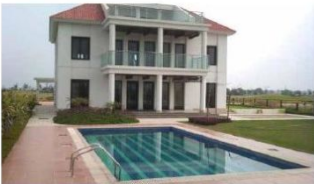
Sample Villa at The Imperial Golf Estate