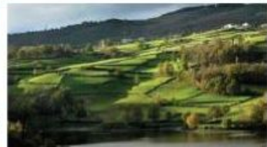
Silverglades Hill Homes