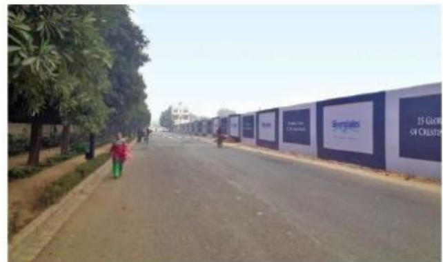
Access from 18-metre-wide road

Silverglades is all set to raise the bar of luxury condominium living in Gurgaon – again. This time, in the shape of iconic towers that will emerge on a prime location in Sushant Lok, Gurgaon, located right opposite the legendary Laburnum Condominium.