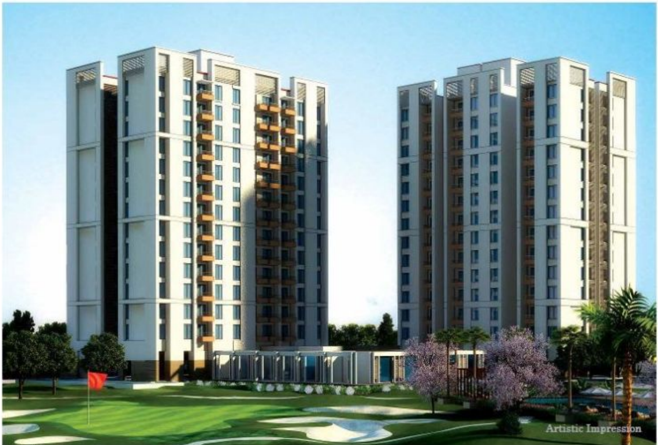
First Citizen Tower

First Citizen is a part of a 17.5 acre community - The Melia and is Delhi-NCR's first premium senior living community. The concept behind this housing development is to integrate a world class retirement community within the modern contemporary commune of quality conscious homes for people who aspire to a rewarding lifestyle at a serene and convenient location near Gurgaon.