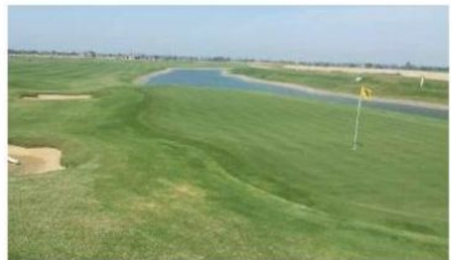
View of the first 9 holes of the Golf Course nearing completion

On the outskirts of Ludhiana, the Imperial Golf Estate presents a unique experience in luxury for golf enthusiasts. Surrounded by the stunning natural beauty of an 18-hole world-class golf course designed by internationally renowned Nicklaus Design, the Imperial Golf Estate offers enthusiasts a rare opportunity to practice the game on a course that bears the mark of one of the most creative course designers in the world, the legendary champion Jack Nicklaus.