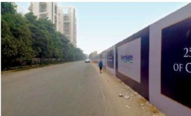
Site barricading done