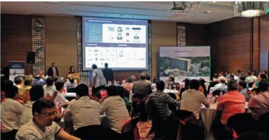
Merchant Plaza Launch Event