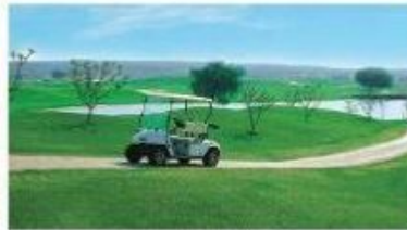
Classic Golf Resort*