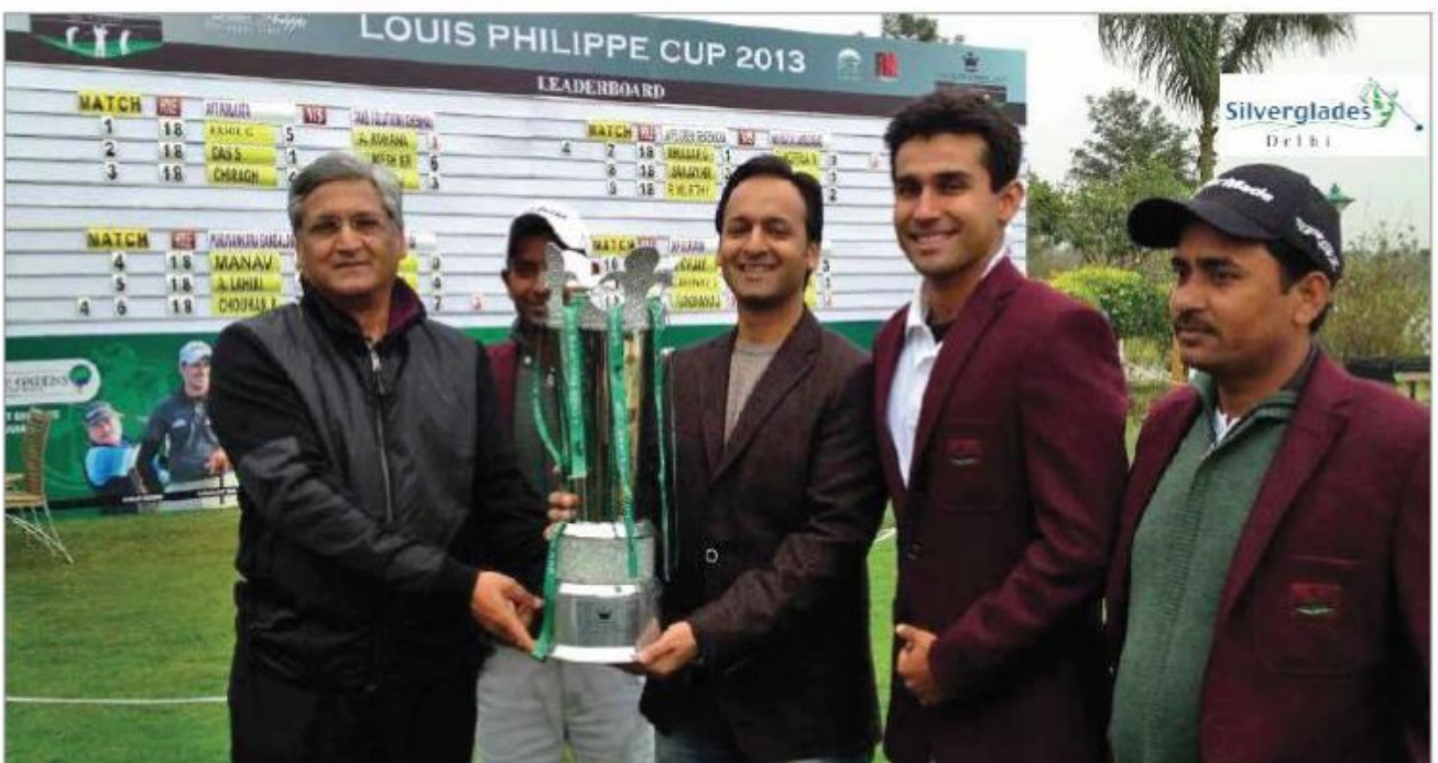
Silverglades, Delhi – Winner of Louis Philippe Cup 2013