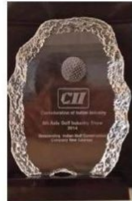
CII Award 2014 - Silverglades awarded the most Outstanding Golf Construction Company New Courses