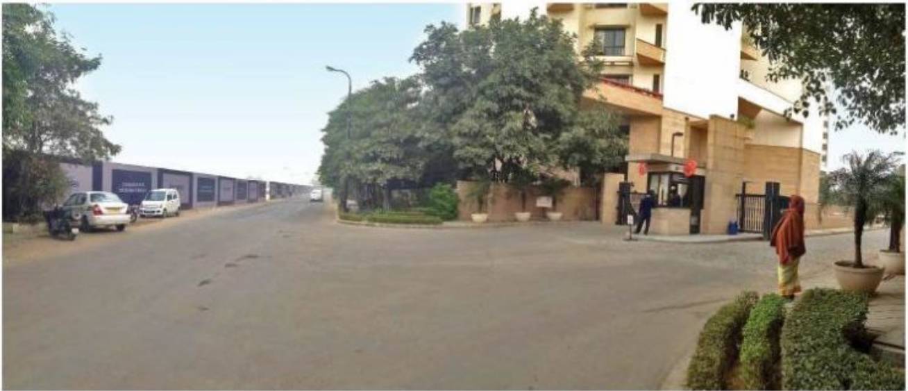
Project site opposite Laburnum