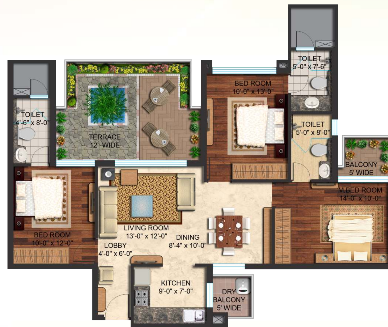
Super Area - 1620 sq. ft. 3BHK + 3T + TERRACE

Disclaimer : In the interest of project, floor plans, layout plans, areas, dimensions and specifications are indicative and may change as decided by the company or by the competent authority.