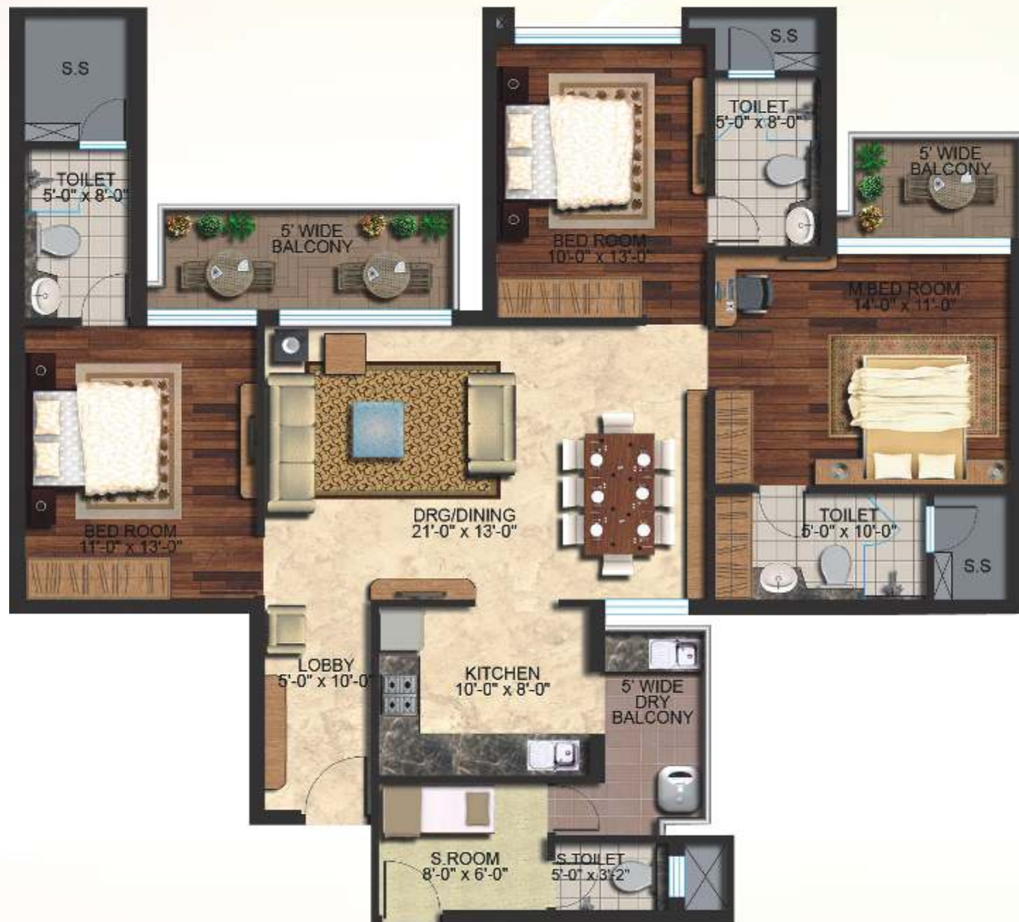
Super Area - 1815 sq. ft. 3BHK + 3T + SR

Disclaimer : In the interest of project, floor plans, layout plans, areas, dimensions and specifications are indicative and may change as decided by the company or by the competent authority.