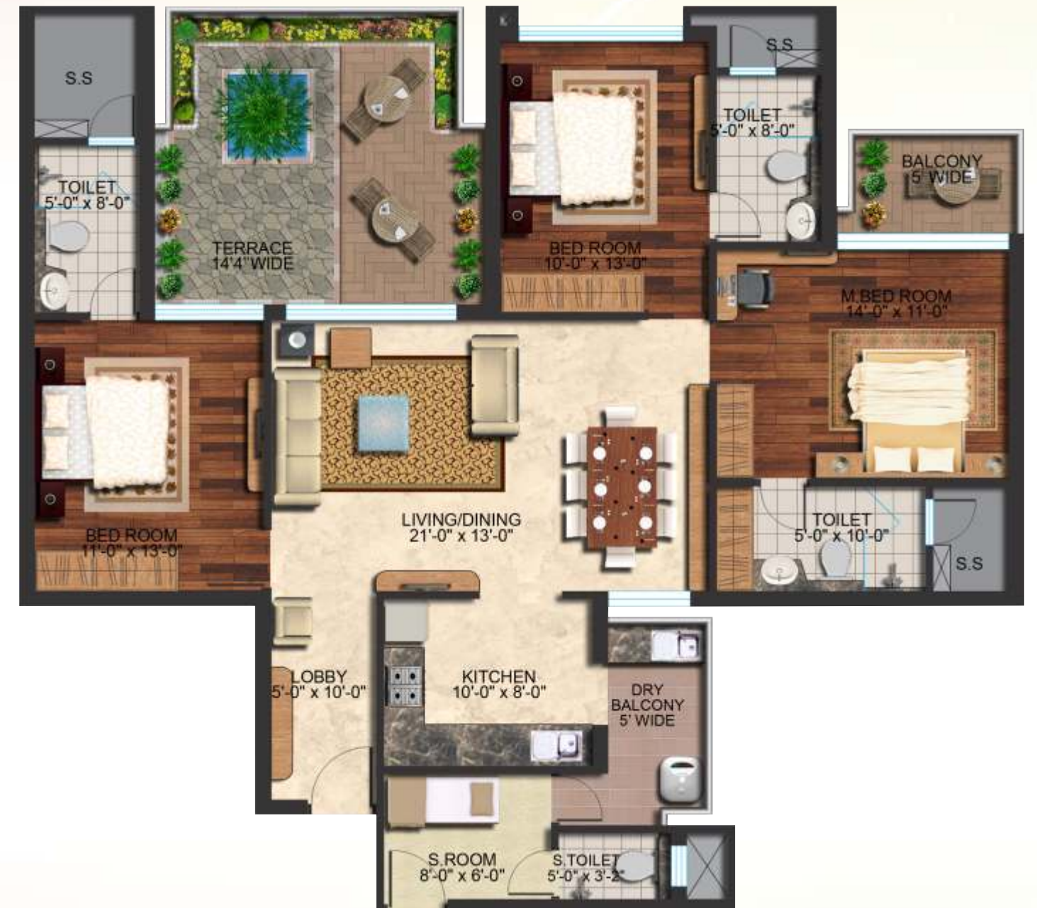
Super Area - 1960 sq. ft. 3BHK + 3T + SR + TERRACE

Disclaimer : In the interest of project, floor plans, layout plans, areas, dimensions and specifications are indicative and may change as decided by the company or by the competent authority.