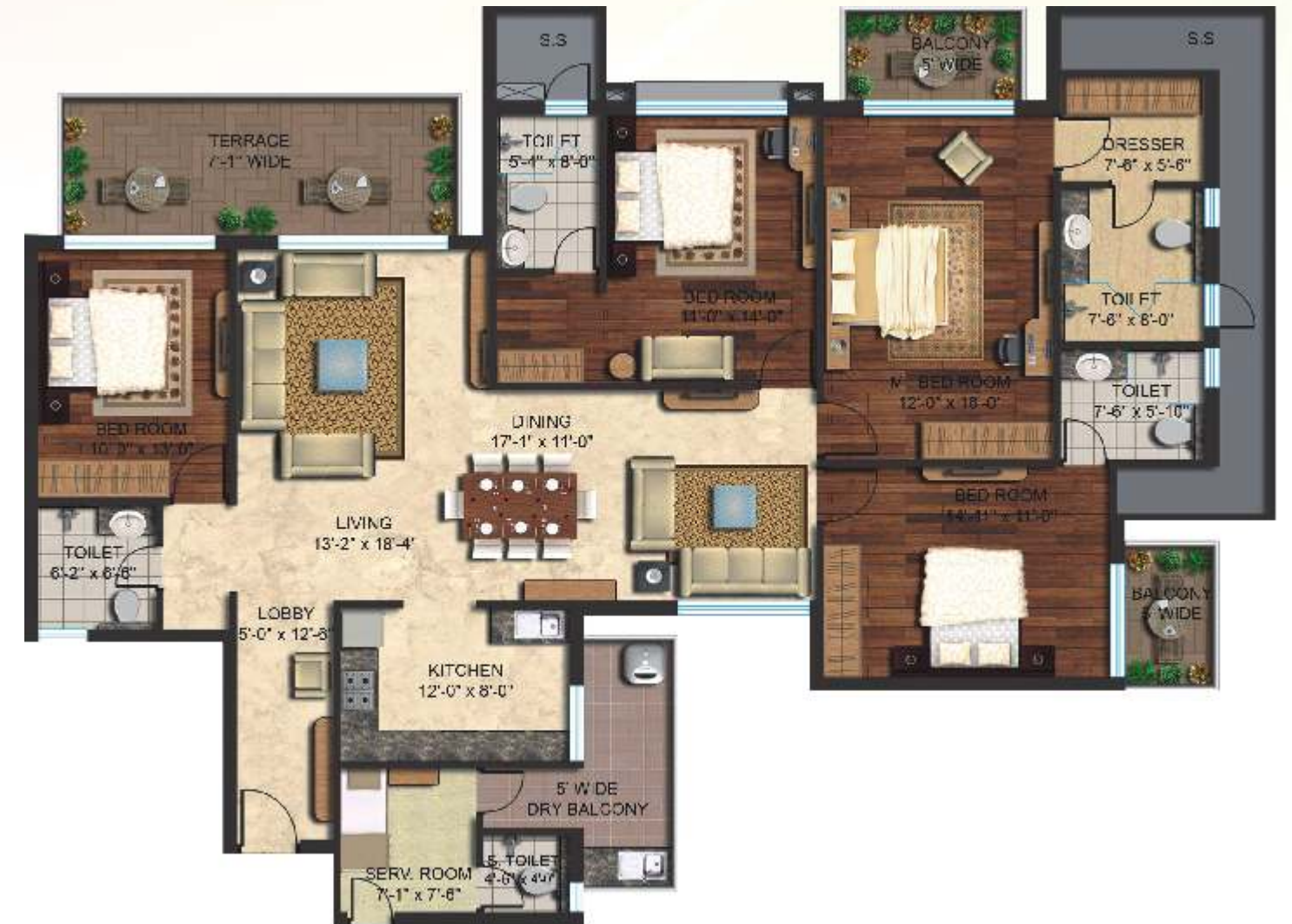
Super Area - 2710 sq. ft. 4BHK + 4T + SR + TERRACE

Disclaimer : In the interest of project, floor plans, layout plans, areas, dimensions and specifications are indicative and may change as decided by the company or by the competent authority.