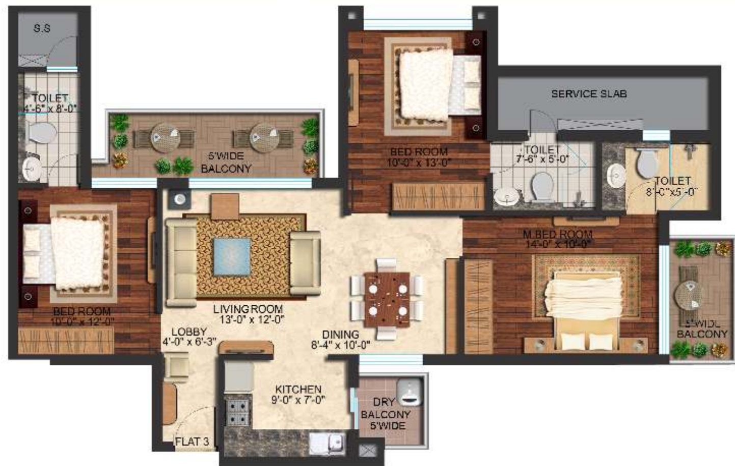
Super Area - 1510 sq. ft. 3BHK + 3T