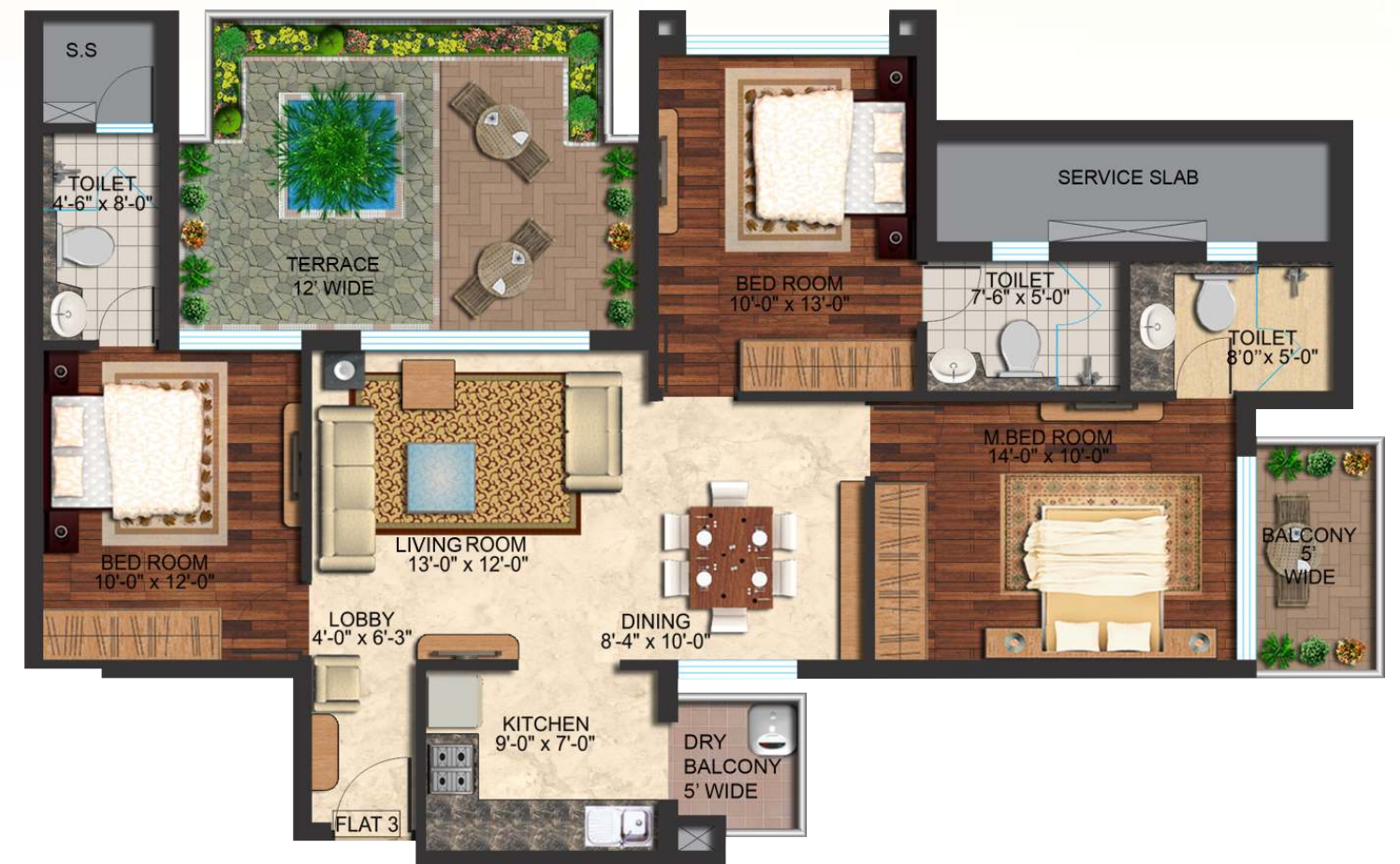
Super Area - 1620 sq. ft. 3BHK + 3T + TERRACE

Disclaimer : In the interest of project, floor plans, layout plans, areas, dimensions and specifications are indicative and may change as decided by the company or by the competent authority.