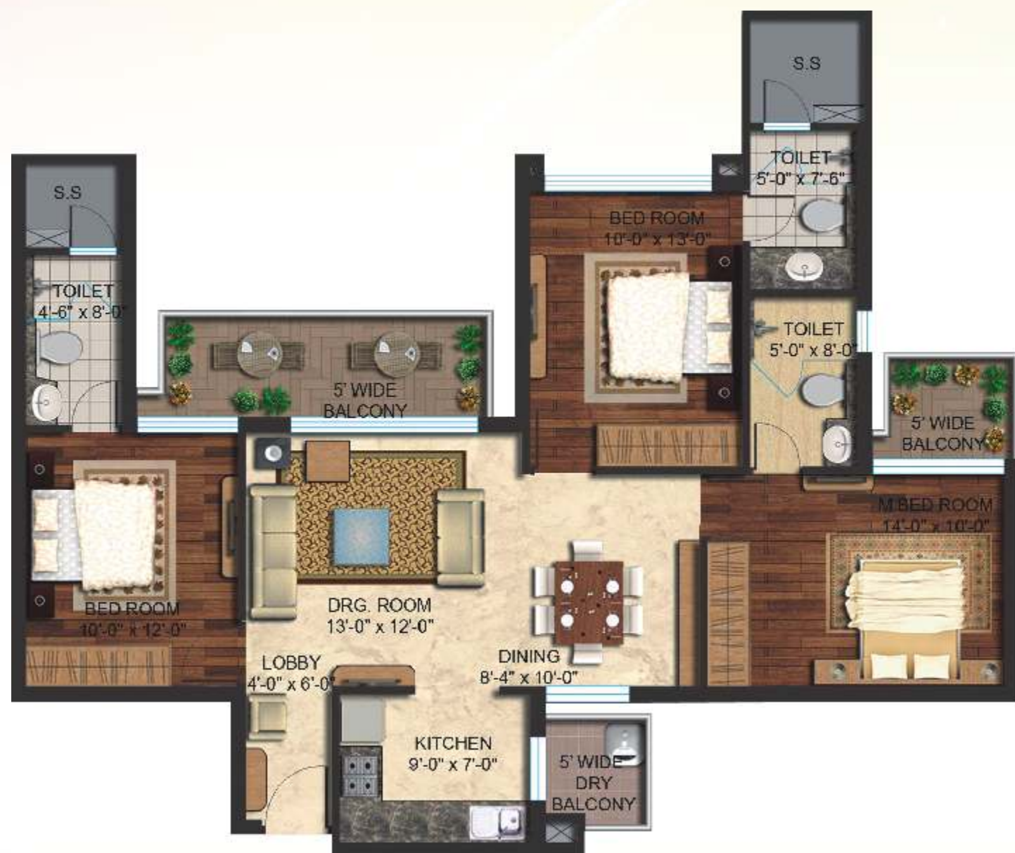
Super Area - 1490 sq. ft. 3BHK + 3T