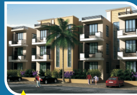
Mapsko City Homes, Sonapat