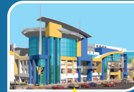
Krishna Apra D Mall Indrapuram, Ghaziabad