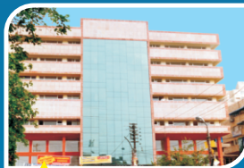
Krishna Apra Plaza, Noida