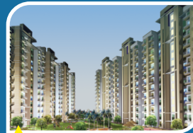
Mapsko Paradise, Gurgaon