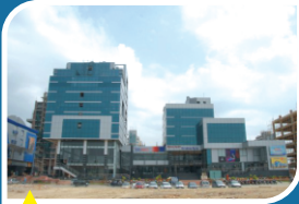
Krishna Apra Business Square Pitam Pura, New Delhi