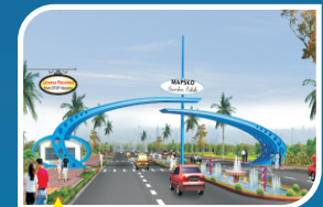
Mapsko Garden Estate Sonapat