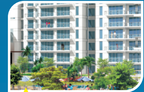
Mapsko Business Arcade, Sonapat