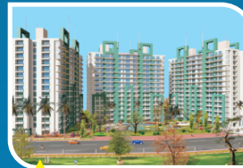
Krishna Apra Sapphire Indrapuram, Ghaziabad