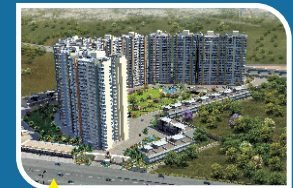
Mapsko Casa Bella, Gurgaon