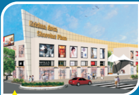
Krishna Apra Shopping Plaza Indrapuram, Ghaziabad