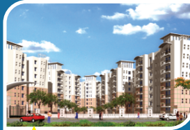
Krishna Apra Residency, Noida