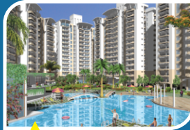
Krishna Apra Gardens, Indrapuram, Ghaziabad