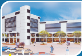
Krishna Apra Park Plaza Greater Noida