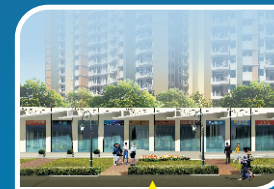
Mapsko Shopping Arcade, Gurgaon